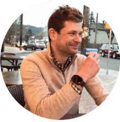
Calvin & Hobbes Superfan Super Smash Bros Ninja GTD Nut